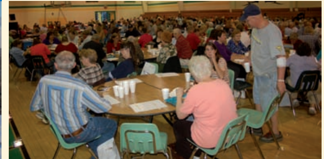
About 500 people attended our 2012 Annual Meeting at the East Hardy High School gymnasium, where they enjoyed a pork barbecue meal and heard about our upcoming OneNet service.