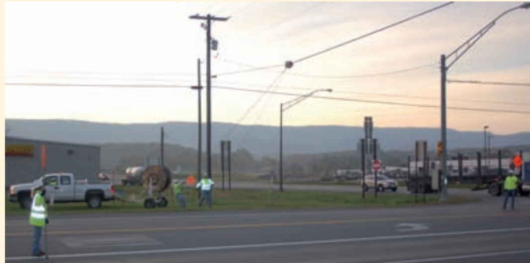
Above and below middle: Employees of ER Excavating & Utilities begin work on Hardy OneNet by placing fiber along U.S. 220 North in Moorefield.

AnchorRing was partially funded by the federal National Telecommunications and Information Administration Broadband Technologies Opportunity Program. It was designed to establish a fiber ring and bring faster Internet to "critical anchor institutions" in Hardy County, such as emergency, medical, educational, government, and other public service organizations. More than 122 miles of fiber have been constructed as part of AnchorRing.