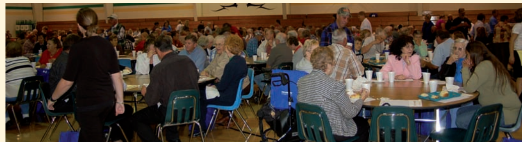
About 500 people attended Hardy’s Annual Meeting of Members on October 1 at East Hardy High.

• WHEN? The project should be substantially completed in about two years, with the goal of being finished in three years.