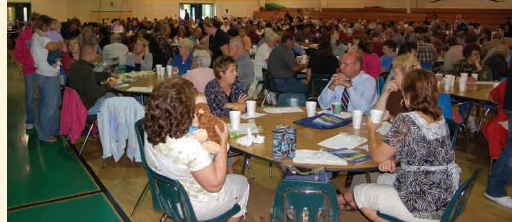
nacked house turned out for the 2008 Hardy Telec