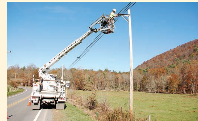
Contractors string fiber-optic cables on utility poles during the early stages of Hardy OneNet construction.

“The difference between now and when we were under the federal project is that now