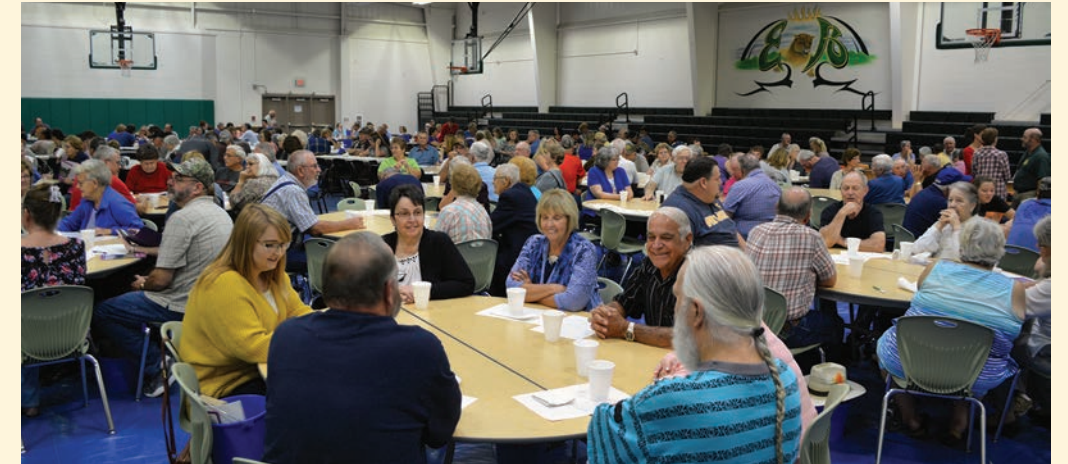
More than 400 people enjoyed the pork barbecue dinner at our 2018 Annual Meeting.