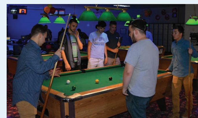
East Hardy High School's Class of 2019, along with EHHS faculty, gather at South Branch Potomac Lanes for bowling and pool at the After-Graduation Party sponsored by Hardy Telecommunications.

Hardy Telecommunications thanks everyone who donated items or otherwise supported the EHHS After-Graduation Party, held May 24 at South Branch Potomac Lanes. We had a great turnout from East Hardy High graduates and faculty. We appreciate your support in giving East Hardy students a place to celebrate their accomplishments in a safe, alcohol-free environment. The party would not be successful were it not for the generosity of the community members who contribute to its success.