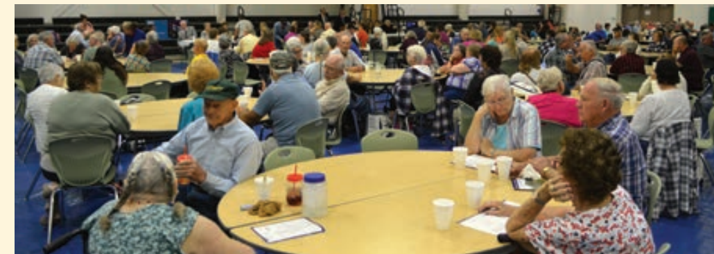
About 400 people attended the 2019 Annual Meeting of Members at East Hardy High School, enjoying a pork barbecue meal.