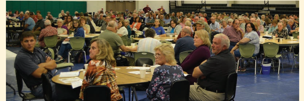
Attendees listen to presentations at the 2023 Hardy Annual Meeting of Members at East Hardy High School.