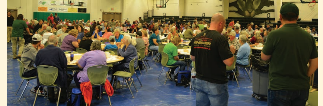
Attendees enjoyed the pork barbecue meal at the 2024 Hardy Annual Meeting of Members at East Hardy High School.